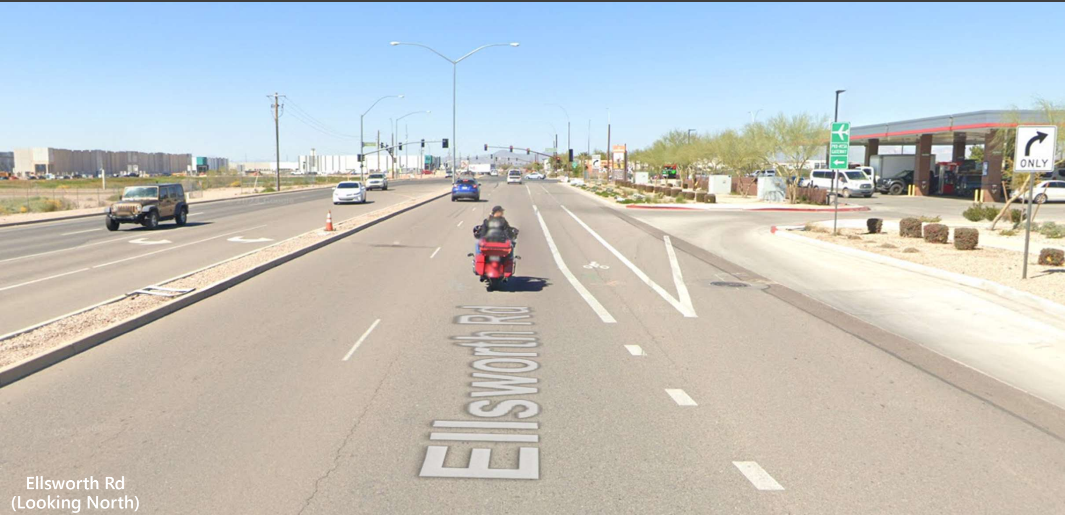
Ellsworth Rd (Looking North)