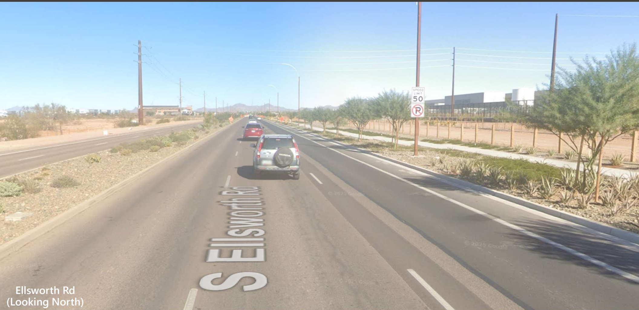
Ellsworth Rd (Looking North)