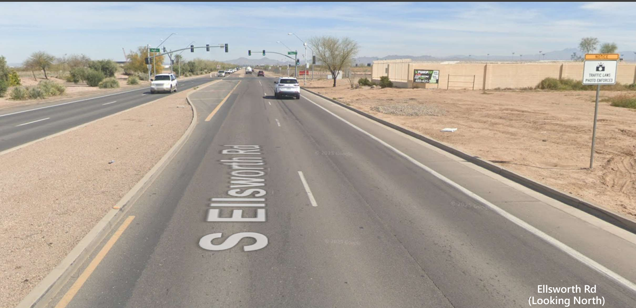
Ellsworth Rd (Looking North)