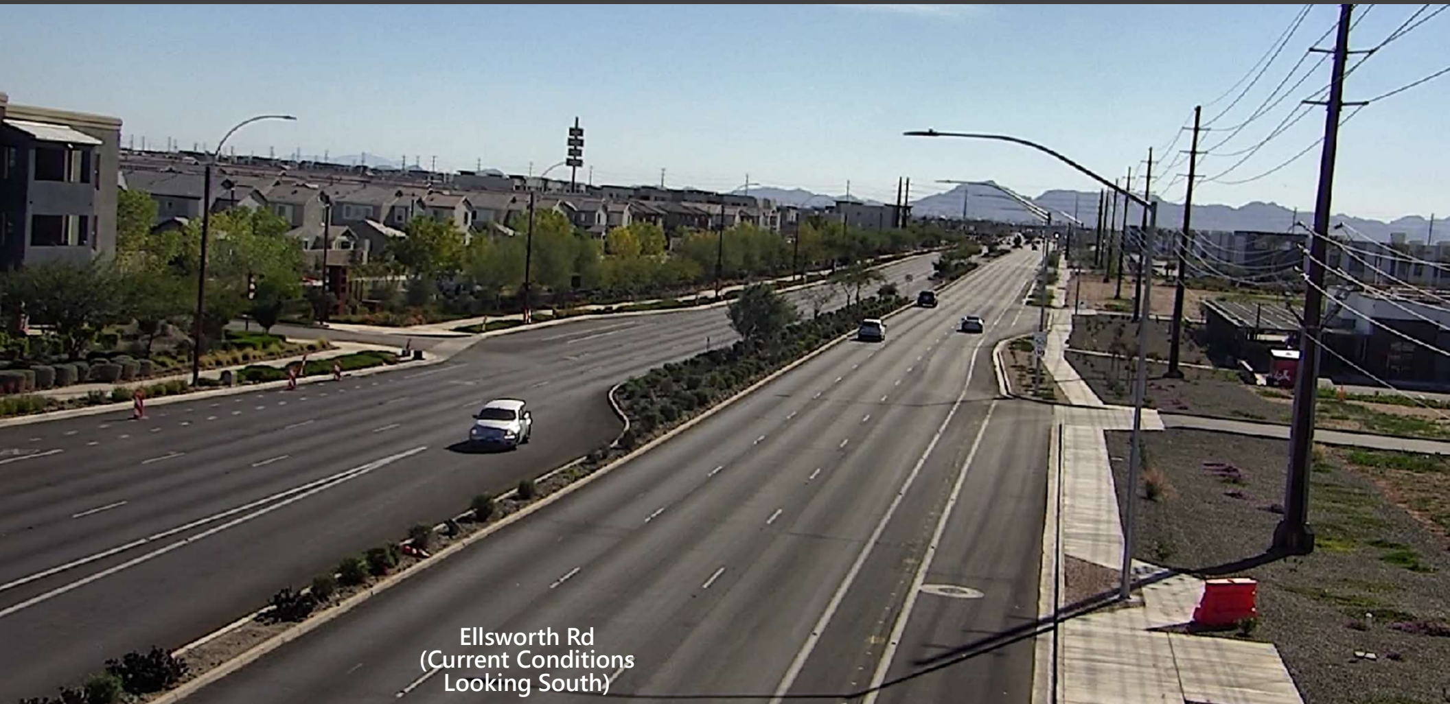
Ellsworth Rd (Current Conditions Looking South)