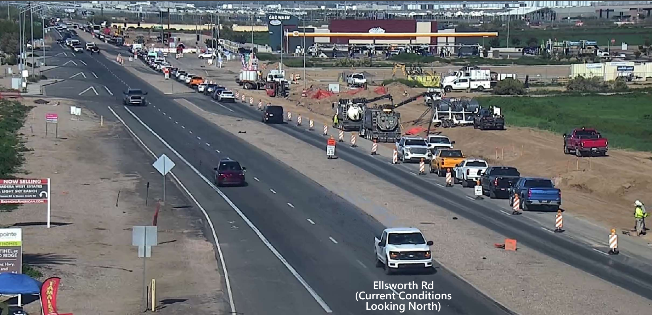
Ellsworth Rd (Current Conditions Looking North)