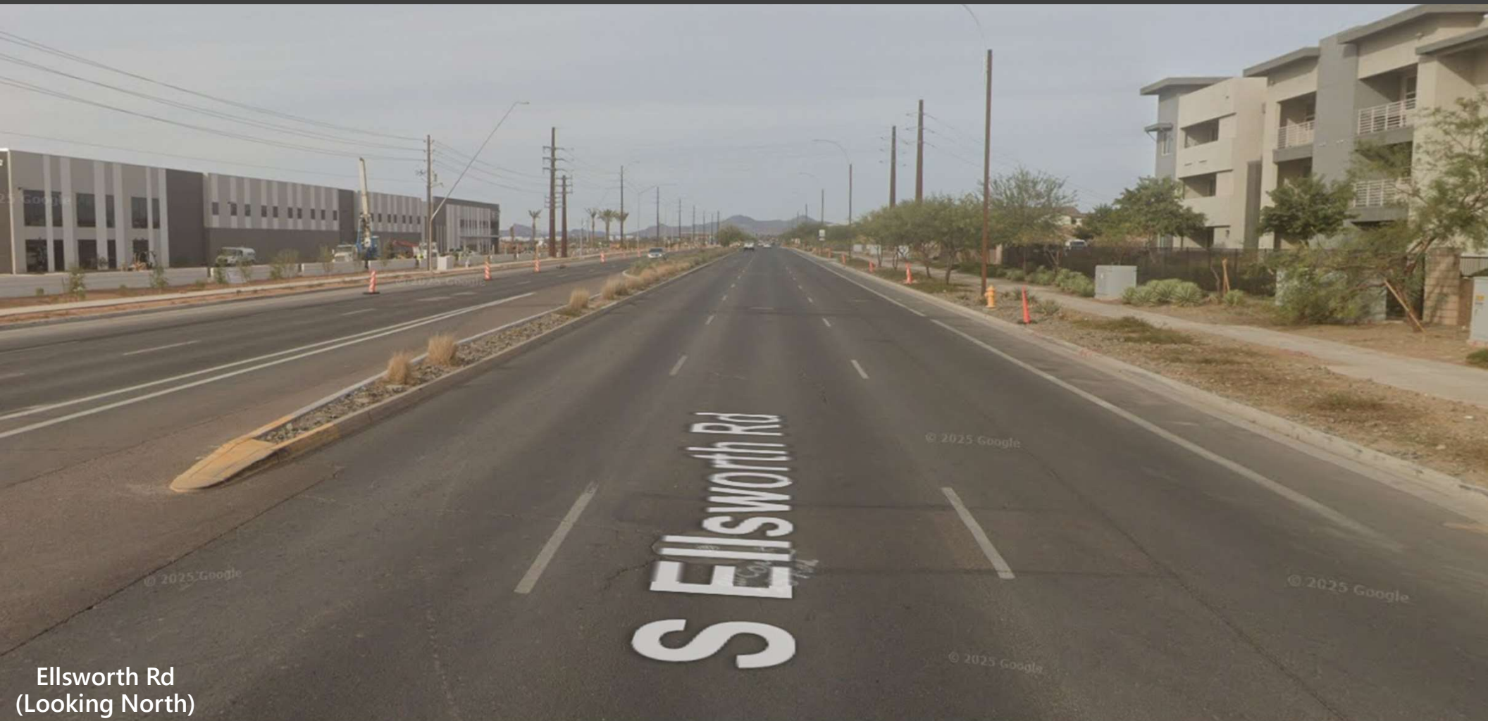
Ellsworth Rd (Looking North)