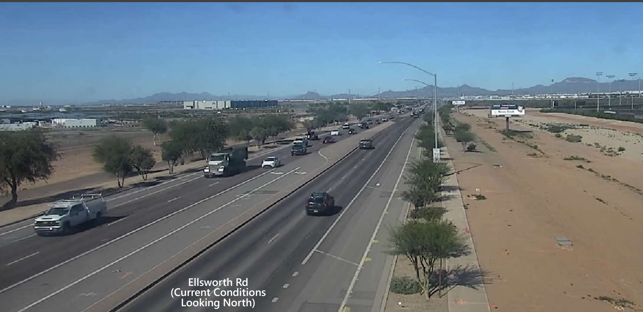
Ellsworth Rd (Current Conditions Looking North)